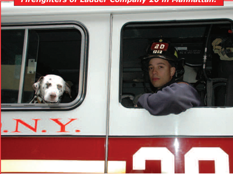
The FDNY FireDog "Twenty" rides along with the Firefighters of Ladder Company 20 in Manhattan.

H ow to have hot fun in the summer time without getting burned!